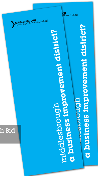
Middlesbrough Bid brochure

Information has already been circulated to town centre businesses relating to the development of a BID and you will have received a copy of the BID brochure (pictured below) outlining how a BID works, how you can influence its development and how you can get involved.